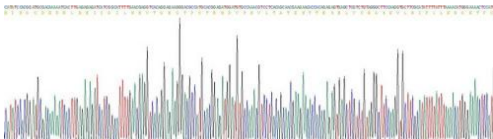
Figure 1. Gene Sequencing (Extract)