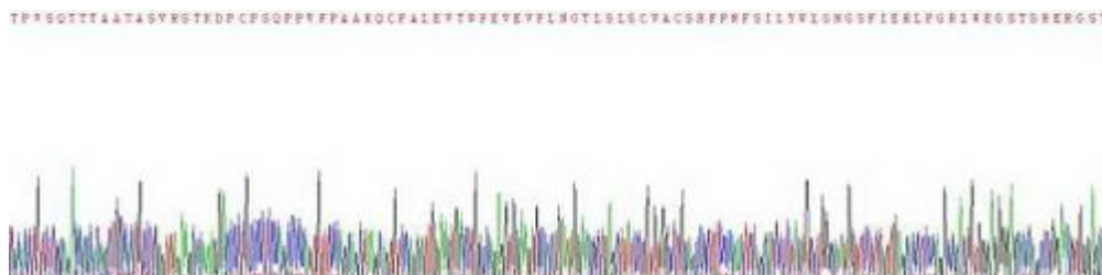
Figure 1. Gene Sequencing (Extract)