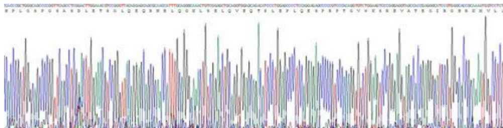
Figure 1. Gene Sequencing (Extract)