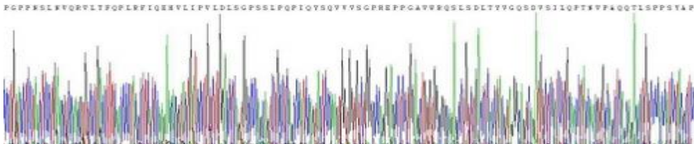
Figure 1. Gene Sequencing (Extract)